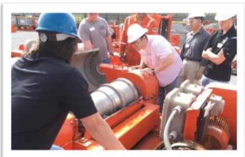
Students attending M-I SWACO solids control facility and examining various equipment.

On Friday February 23 rd , 33 UL Petroleum students went on a tour organized by IADC and AADE student chapters at M-I SWACO solids control facility.